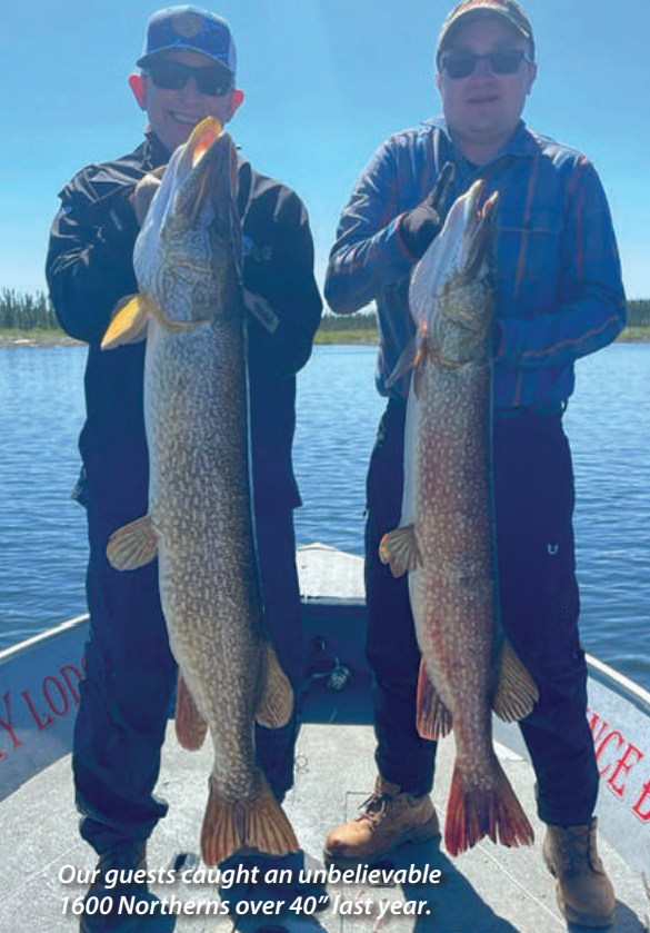
Our guests caught an unbelievable 1600 Northerns over 40" last year.