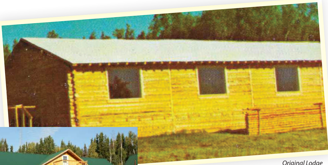
Original Lodge built in 1971.